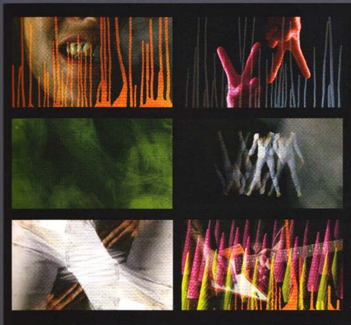
STILLS FROM YOUNG AND FREE , 2010